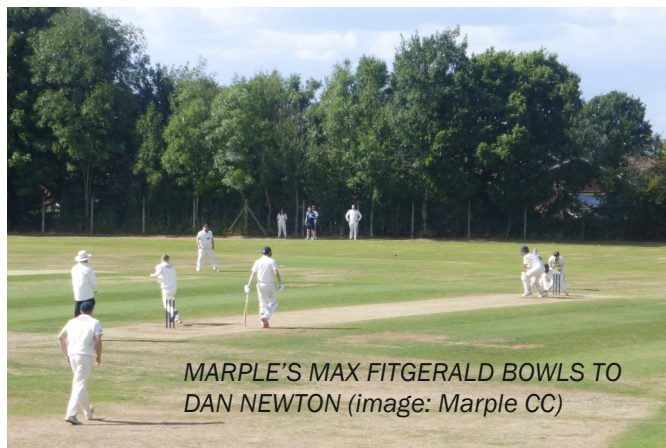
MARPLE'S MAX FITZGERALD BOWLS TO DAN NEWTON